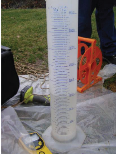
Water from [redacted] potable well 3-16-26 @ 9:13