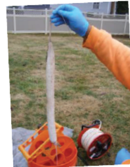
Pulled absorbent sock from [redacted] potable well 3-16-26 @ 9:56