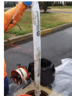
Recovered absorbent sock from recovery well RW-3 in Drive. 3-16-26 @ 10:10