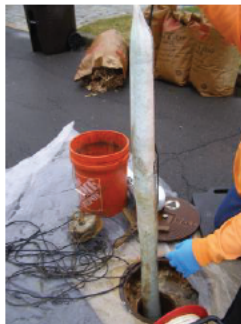
Pulled absorbent sock from recovery well RW-2 in Glenwood Drive 3-16-26 @ 10:05