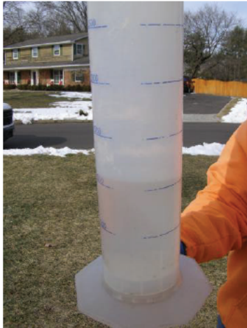
Water from [redacted] potable well 3-2-26 @ 9:19