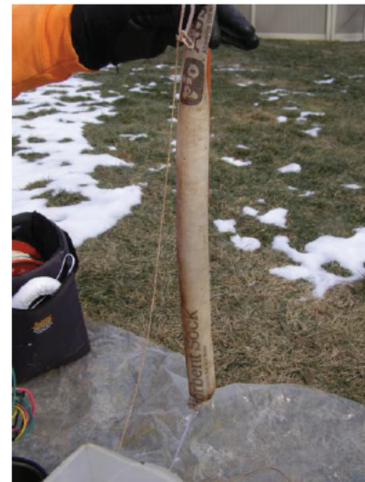
Recovered absorbent sock from the potable well at [redacted] 3-2-26 @ 9:54