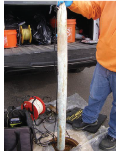
Pulled absorbent sock from recovery well RW-2 in Glenwood Drive 3-2-26 @ 9:35