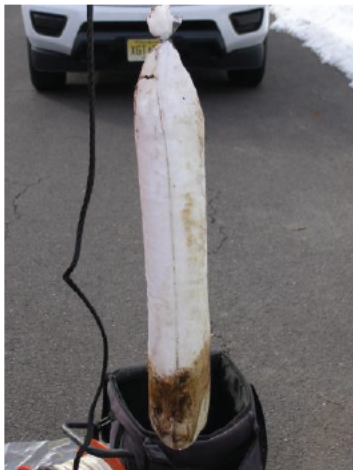
Pulled absorbent sock from recovery well RW-3 in Glenwood Drive 3-2-26 @ 9:49