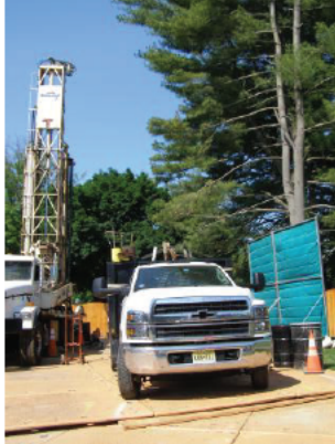
Drill rig over monitoring well MW-16DD 5-18-26 @ 9:42

Facility Name: Glenwood Drive and Walker Road Primary Facility ID: 881609