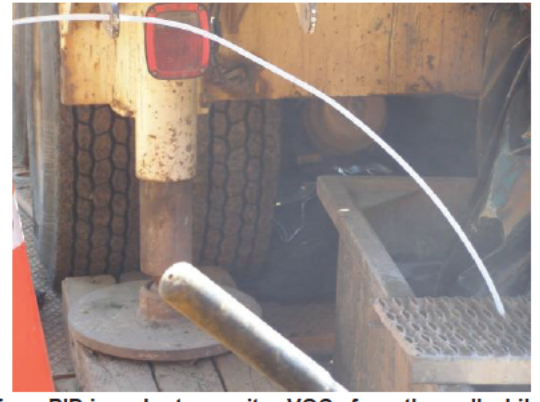
Tube from PID in order to monitor VOCs from the well while it was being drilled. 5-18-26 @ 10:37