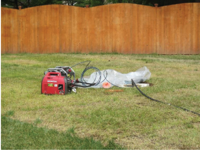
Pumping setup at Well A.