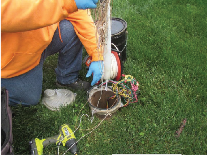
Absorbent sock removal from [redacted] well.