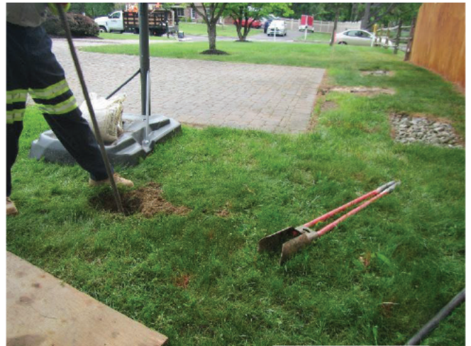
Hand clearing first location on [REDACTED].