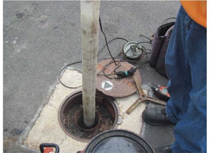
Absorbent sock in RW-3.