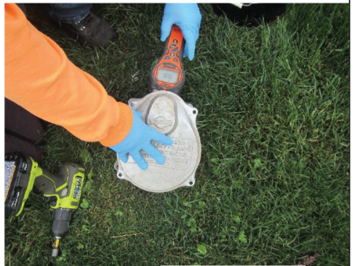
PID measurement at [REDACTED].