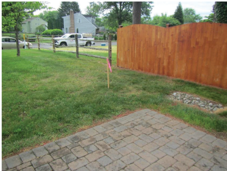
Second well location to hand clear today.