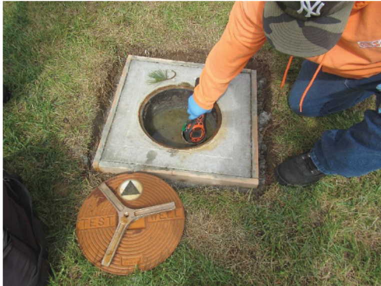
PID measurement in MW-16DD.