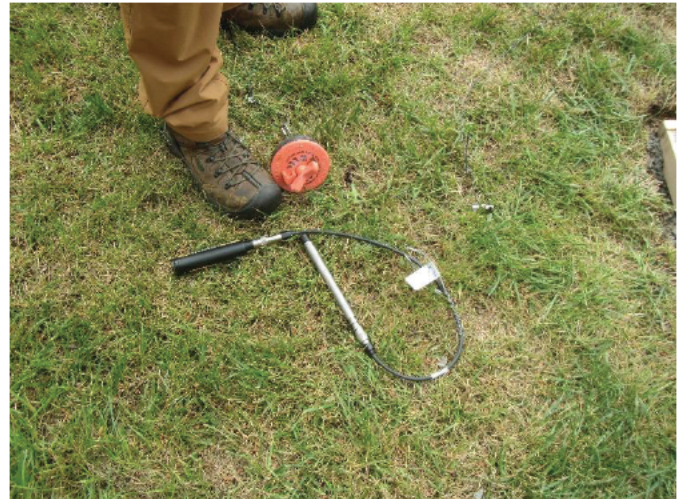
Transducer setup for MW-16DD.