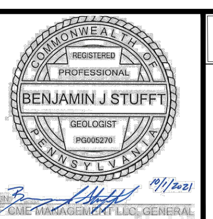
EXHIBIT 7.2: GEOLOGIC CROSS-SECTIONS RUSTIC RIDGE #1 EXPANSION LOWER KITTANNING COAL SEAM CMP#R 0513101 MSHA ID# 3610089 DONEGAL AND SALTICK TOWNSHIPS WESTMORELAND & FAYETTE COUNTIES, PENNSYLVANIA