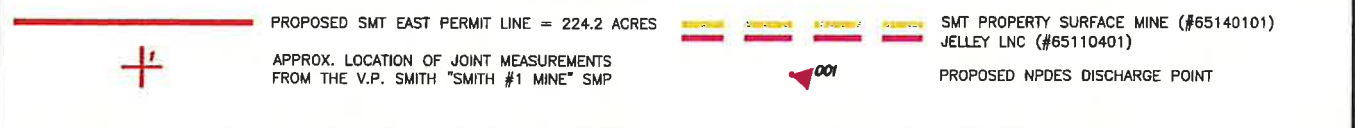
EXHIBIT 6.1: LOCATION MAP

LIGONIER STONE & LIME COMPANY SMT EAST SURFACE MINE