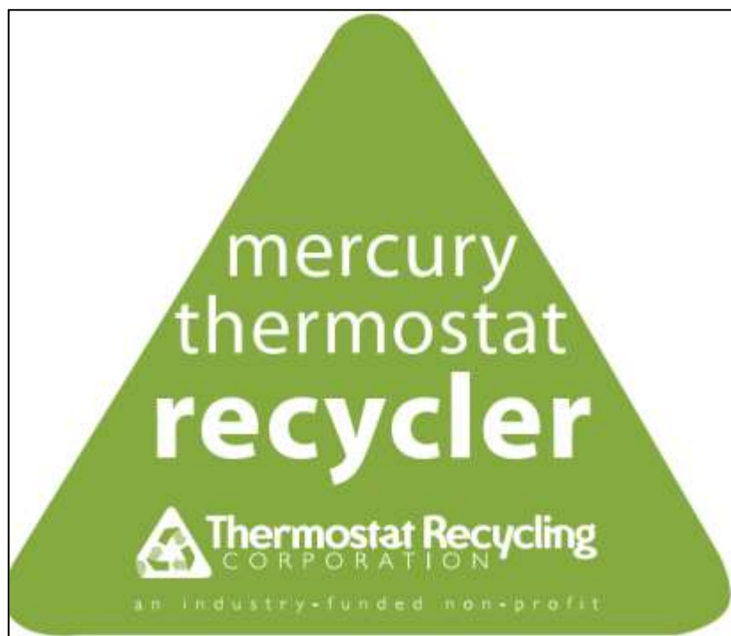
Exhibit 2: Example of New Print Collateral—Vehicle Cling Sticker

In partnership with the Heating, Air-Conditioning & Refrigeration Distributors International (HARDI), TRC re-launched the Mercury Thermostat Recycling Awards in May 2012 . The award(s) are intended to incent participation in the program by recognizing the distributor(s) that recovered the most mercury thermostats and/or developed innovative strategies to promote the program at their branch location(s).