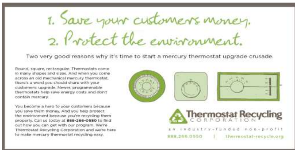
Exhibit 7: Advertisement Copy HVACR Business Magazine

HVACR Business is a national publication with approximately 30,000 qualified subscribers.