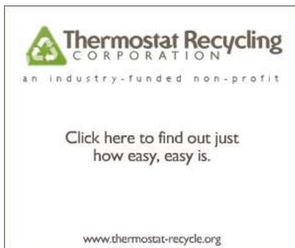
Exhibit 5: Web Banner Advertisement (300x250 fixed image version)

Ads and landing pages were developed with variable messages targeting both audiences. What made this campaign unique is the fact that it was targeted. Advertisements appeared on Google search results pages after an individual searched terms related to TRC’s mission (E.g. thermostat replacement, contracting recycling regulations, mercury thermostat recycling, programmable thermostats, etc.). Similarly, the Facebook campaign targeted users over 18 who "like" industry-relevant topics or organizations (i.e. renovating, renovators, HVAC, HVAC Technicians, home repair, etc.).