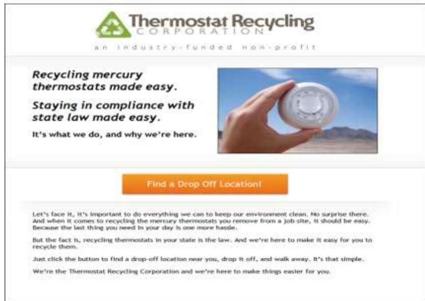
Exhibit 6: Google “Landing Page:

Print Advertisement HVACR Business Magazine — TRC placed a ½ page color advertisement in a special section on thermostats in the April addition.