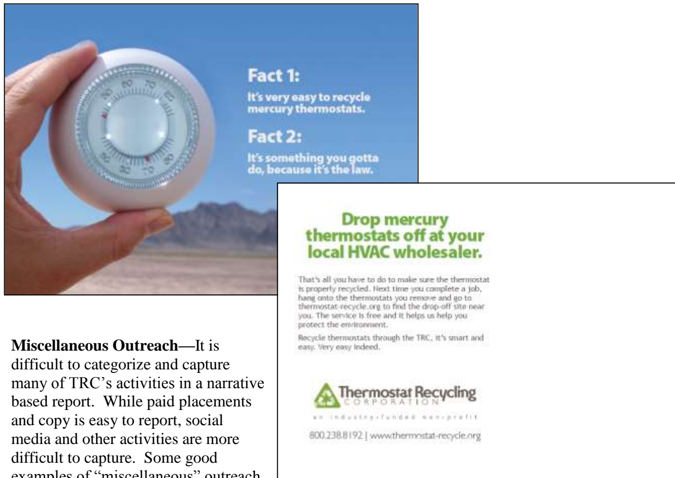
Exhibit 8: Front & Back of Postcard

Miscellaneous Outreach —It is difficult to categorize and capture many of TRC’s activities in a narrative based report. While paid placements and copy is easy to report, social media and other activities are more difficult to capture. Some good examples of “miscellaneous” outreach include: