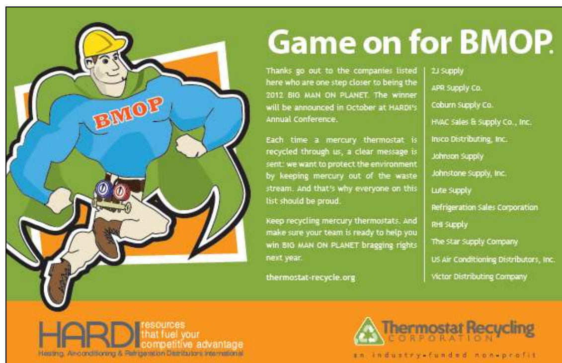
Exhibit 3: Distribution Center Magazine BMOP Advertisement

The award was presented at HARDI’s annual meeting in October 2012 .