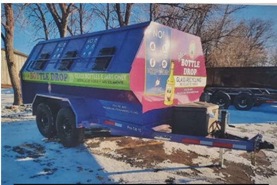
Image of the CAP traveling glass recycling bin

If the Township does not have the space to construct a bunker large enough to contain at least 20 tons of glass, the Pennsylvania Resources Council (PRC) provides the option of a traveling glass bin to municipalities. Municipalities pay a fee to host the glass recycling bin for one week before moving to its next destination. During that week, residents would be encouraged to drop-off glass bottles and jars into the container. The bin is accessible from Saturday through Thursday during daylight hours.