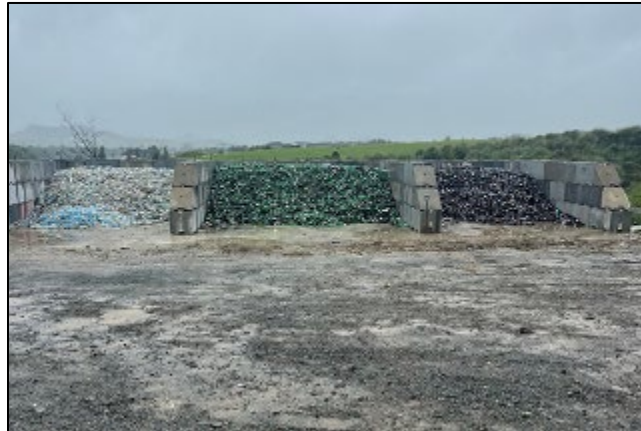
Example Bunker Number Three 5 block deep x 5 block wide x 3 block high – 45 blocks needed (30' x 30' x 6')