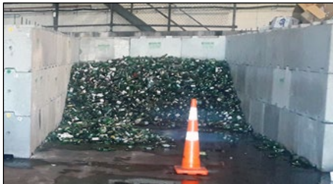
Example Bunker Number One

To follow the example of Adams County, Thompson Township would have to devote additional space at the equipment yard, or another Township owned location to build a glass collection bunker. The bunker should be capable of storing at least 20 tons of glass, the quantity required for some vendors to build and service the site at either low or zero cost to the Township. The glass bunker should be built on Township owned property that includes equipment to load glass materials into a container delivered to CAP Glass. The recommendation is a bunker 20' wide x 24' deep x 8' tall using roughly 40 concrete blocks. Below are some glass bunker set ups that other recyclers have built in the past.