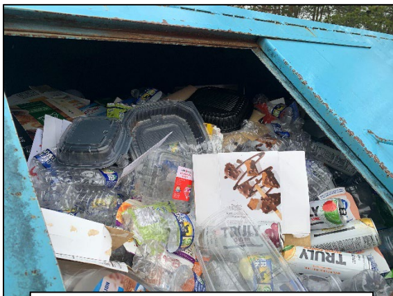
Recyclable materials in the drop-off program roll-off container.

The cost to subscribe to the program covers the use of the container and the transportation of the container, by Parks Refuse, to Apple Valley Waste in Hagerstown, Maryland. With current participation levels, the container is emptied around five times per year. The drop-off facility is open for subscribers to deliver recyclable materials every Saturday with a Township representative present and available to answer questions and assist in a convenient drop-off.