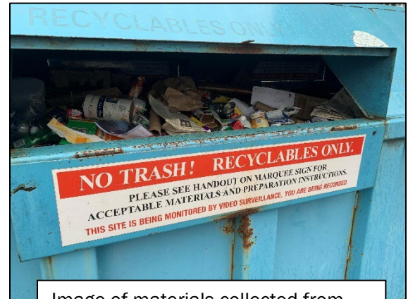
Image of materials collected from Thompson Township residents.

The signage at the drop-off facility did not clearly convey that glass containers are not currently accepted at the facility and Fulton County recycling educational materials, that include Thompson Township, suggest glass is accepted throughout the county. SCS recommends the Township to update signage at the facility and educational materials for residents to clearly understand acceptable materials. It is also recommended to consider the addition of a small garbage can on-site for folks to dispose plastic garbage bags used to transport materials to the site.