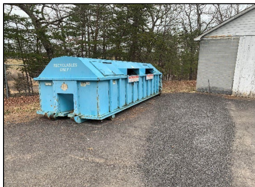
Roll-off container for subscribers to deposit recyclable materials.

The Thompson Township drop-off recycling program is limited in their ability to market the program to residents. The Township does not have a webpage to inform residents of the services provided. To inform residents of the program, SCS wrote a newspaper article to be published in the local Fulton County Newspaper to reach residents and promote the recycling program. The article highlights materials accepted at the drop-off location and general recycling guidance. Appendix A includes the recycling article to be published in the Fulton County Newspaper.