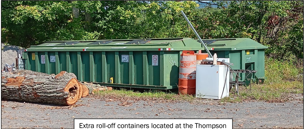
Extra roll-off containers located at the Thompson Township Equipment Yard

The Township could opt for a permanent glass recycling roll off container for residents to drop off glass bottles and jars during the current drop-off hours. This option would function very similarly to the current drop-off recycling subscription program offered by the Township. The extra recycling roll-off containers (pictured below), if owned by the Township, could be repurposed for the collection of glass materials. Otherwise, the container would cost the Township more upfront and require the Township to coordinate the hauling of the container to a glass recycler in the area.