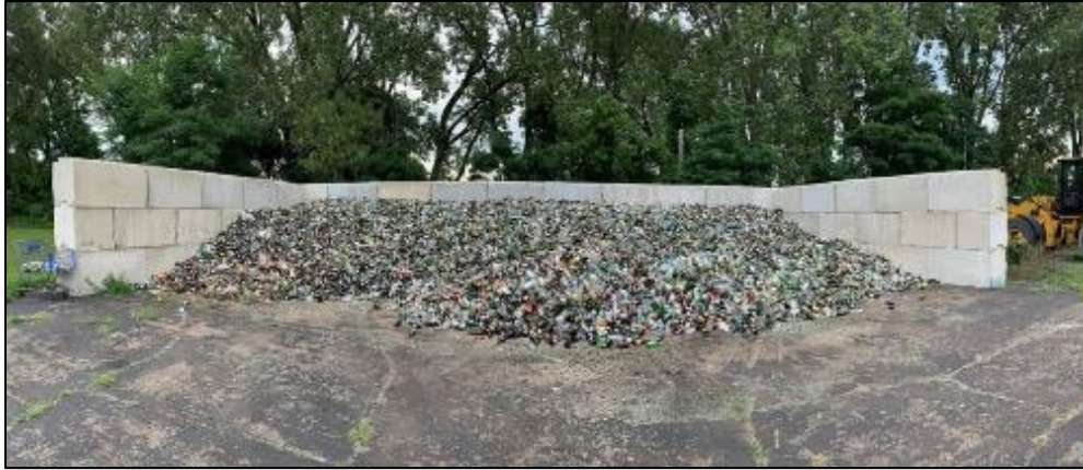
Example Bunker Number Two 5 block deep x 10 block wide x 3 block high – 90 blocks needed (30' x 60' x 6')