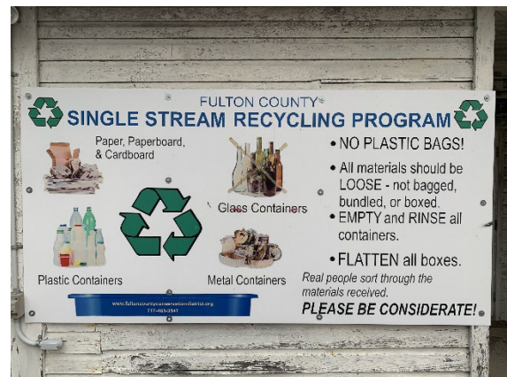
Figure 1 Sign detailing acceptable recycling materials. Note glass is not accepted.