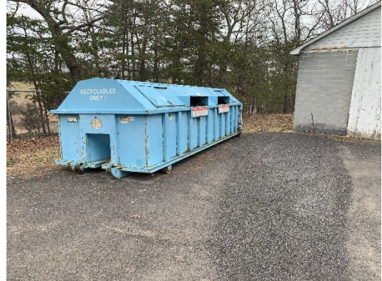
Figure 2 Roll-off container for Township drop-off recyclables.

To sign up to participate in the Township recycling program, please call [phone number]. Note that there is a nominal fee to participate in the program.