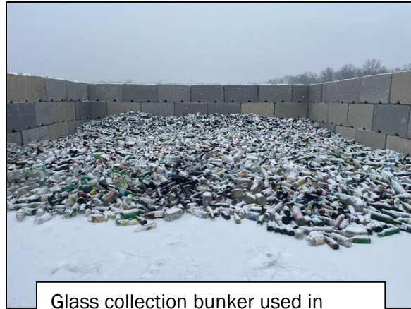
Glass collection bunker used in Adams County, PA

Adams County in Pennsylvania hosts monthly glass recycling drop-off located behind The Adams County Emergency Services building. On the first Saturday of every month the site is open for residents to drop off glass bottles and jars for recycling. Hours of operation depend on the availability of trained volunteers to assist residents in the drop-off process. Once sufficient glass materials are collected, haulers will transport the glass to a glass recycling facility at no charge to the county.