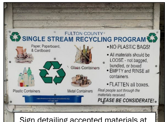
Sign detailing accepted materials at the drop-off site. Note glass is not accepted.

During the site visit, SCS inquired about the details of the current subscription program run by the Township. Out of the nearly 500 households within Thompson Township only about 40 households subscribe to the program to use the drop off container, some from outside township limits. The subscription fee to the program is less than $10 per month. Thompson Township does not have haulers providing curbside recycling, so residents who do not participate in the program likely dispose materials.