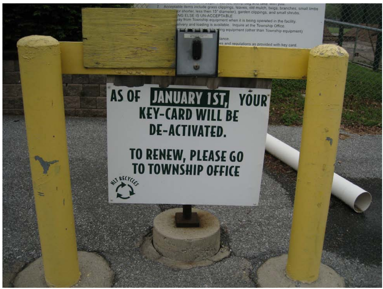
North Lebanon Township key card gate access swiping mechanism.

The Township initially issued 400 access cards at a cost of $1,056. Beginning in January each year, patrons buy a new card to access the site. 1,100 key cards were in use in 2012.