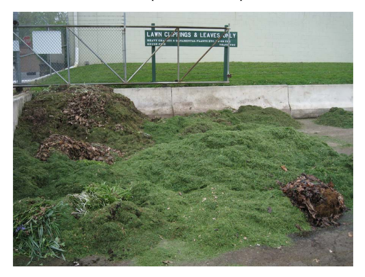
North Lebanon Township automated gate in open position.

After an initial grind, leaves and grass clippings dropped off at the site are added to the wood chips for a second grind that produces a mulch product. The mulch is free to any resident who has an access card. The Township charges a loading fee of $10/scoop for residents who don't or can't load mulch themselves. The Township also delivers much for a fee of $30 for three loader scoops or $70 for a six scoop truckload.