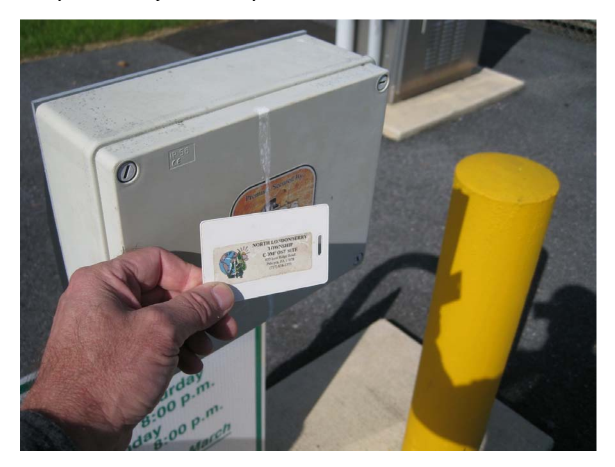
North Londonderry Twp. compost site access key card and swiping sensor.

The Township restricts access to the site to residents who pay a $25 annual registration fee. Those registering are provided with a plastic key card that opens an automated gate with a swipe of the card. The key cards are not available to the private sector as the facility does not accept commercial yard waste.