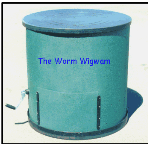
Figure 3: The Worm Wigwam

The Institutional Model 5 by 8, as presented in Figure 4 , is five feet wide, eight feet long, and four feet tall. It is designed for a daily capacity of 75 to 150 pounds per day of organic waste, which means that it can accommodate 40 to 100 pounds per day of residential food waste without the bulking material. The bin is constructed of rot-resistant wood slats in a metal frame. Insulation with an R-14 rating is provided on the interior. The purchase price for one unit is $4,465, which includes an operating manual. The estimated delivery and freight charges are estimated at $569.