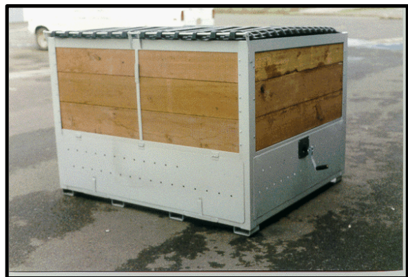
Figure 4: Industrial 5 by 6 Unit (Similar in appearance to 5 by 8 unit)