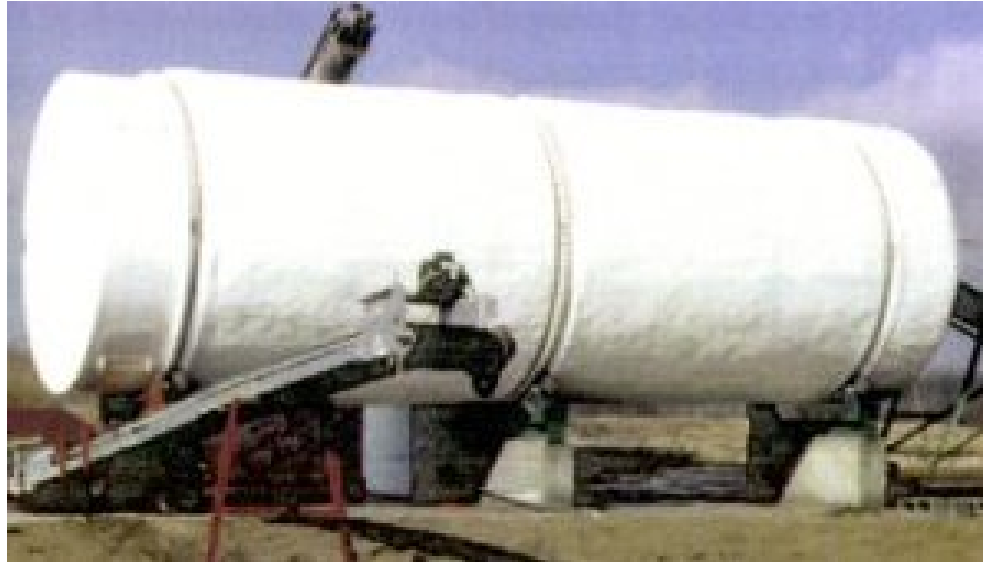
Figure 1 BW Organics Stationary Rotating Drum