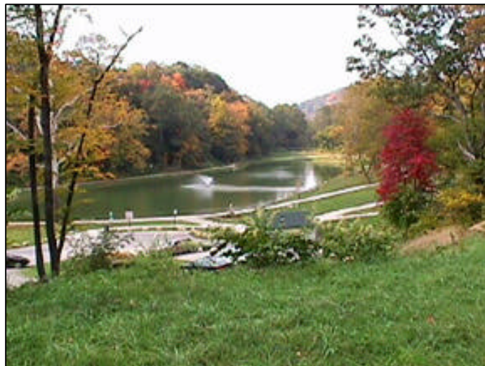
B-Y Park, Trafford Pennsylvania