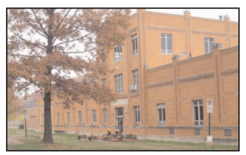
City of Easton Water Treatment Plant was built in 1932.

With the addition of The City of Easton, 111 surface water filtration plants are enrolled in the Partnership program in Pennsylvania.