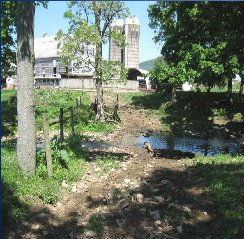
Unimproved Stream Crossing