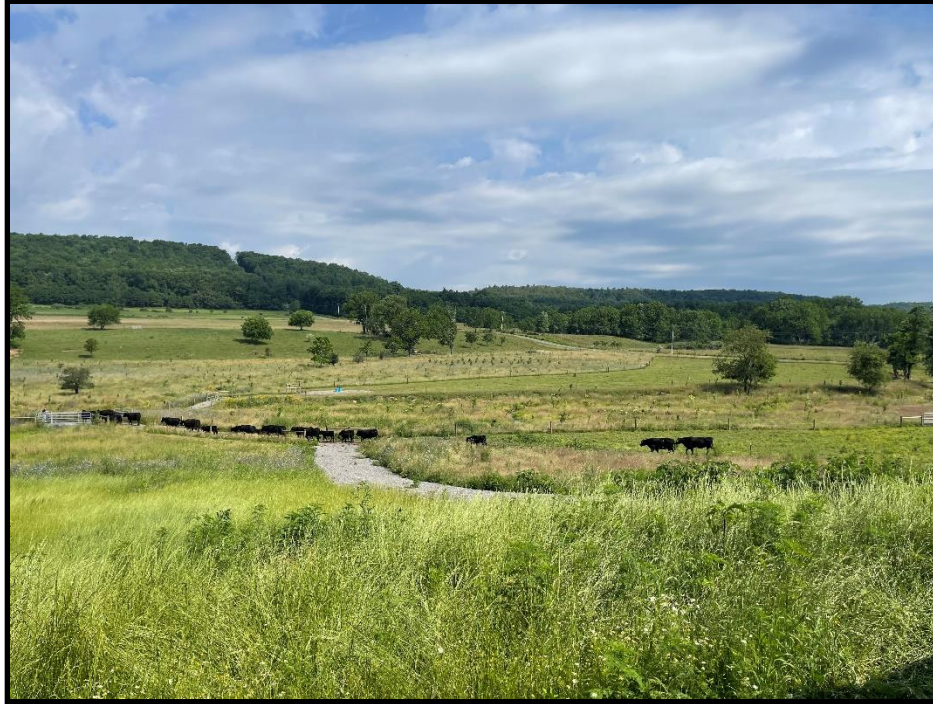
Image 2. Cattle utilizing a new crossing with a newly installed riparian buffer/meadow in the background.