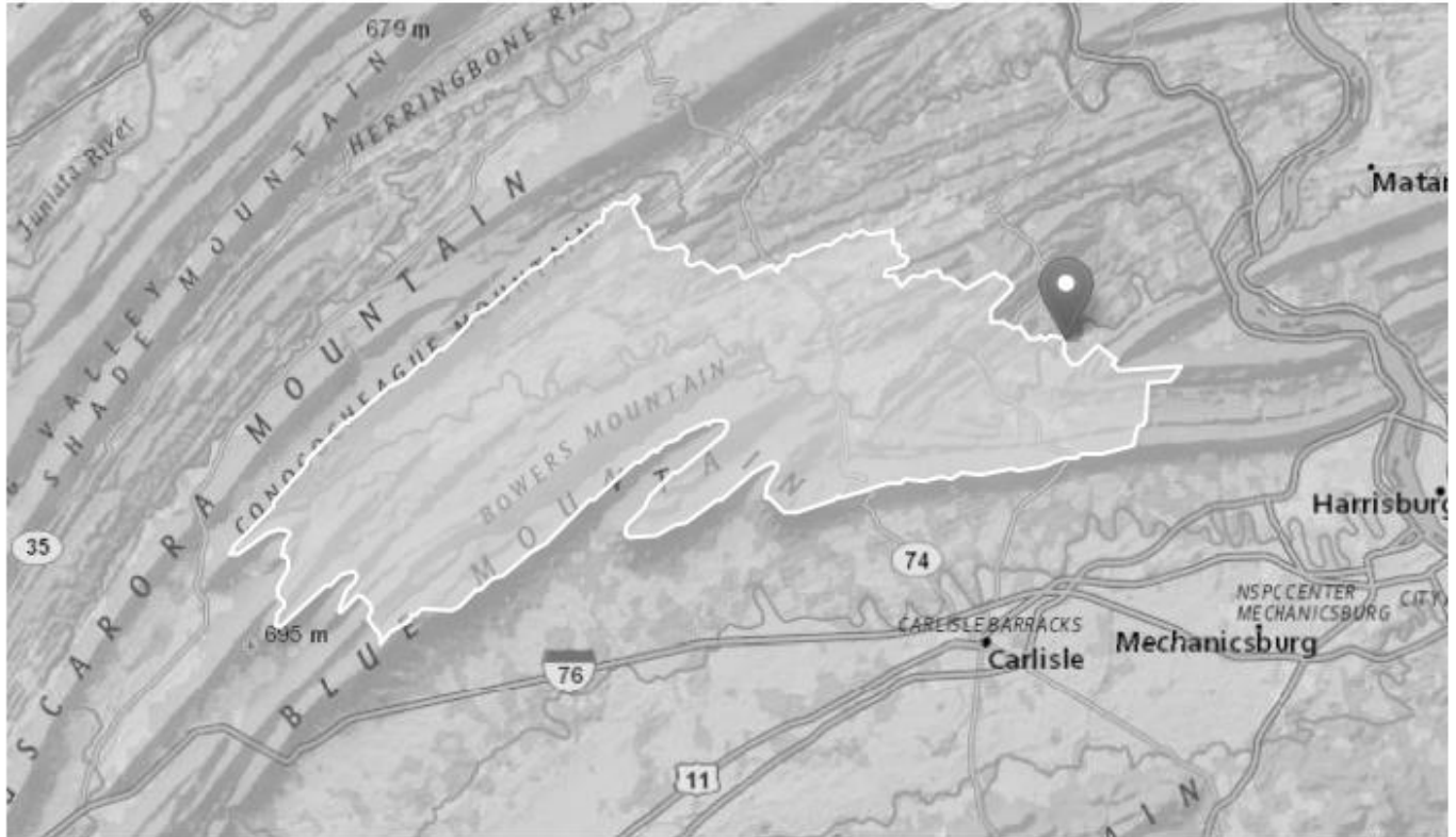
Creekview Farms MHP PA0084051 Modeling Point #2 October 2024

Region ID: PA Workspace ID: PA20241029144329424000 Clicked Point (Latitude, Longitude): 40.35341, -77.13469 Time: 2024-10-29 10:44:04 -0400