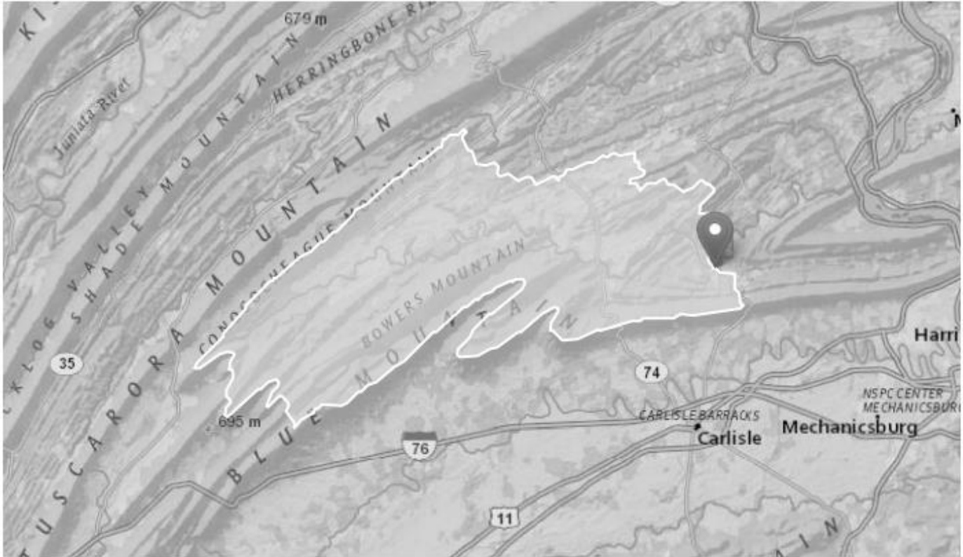
Creekview MHP PA0084051 Modeling Point #3 October 2024

Region ID: PA Workspace ID: PA20241029154802842000 Clicked Point (Latitude, Longitude): 40.32261, -77.16999 Time: 2024-10-29 11:48:41 -0400