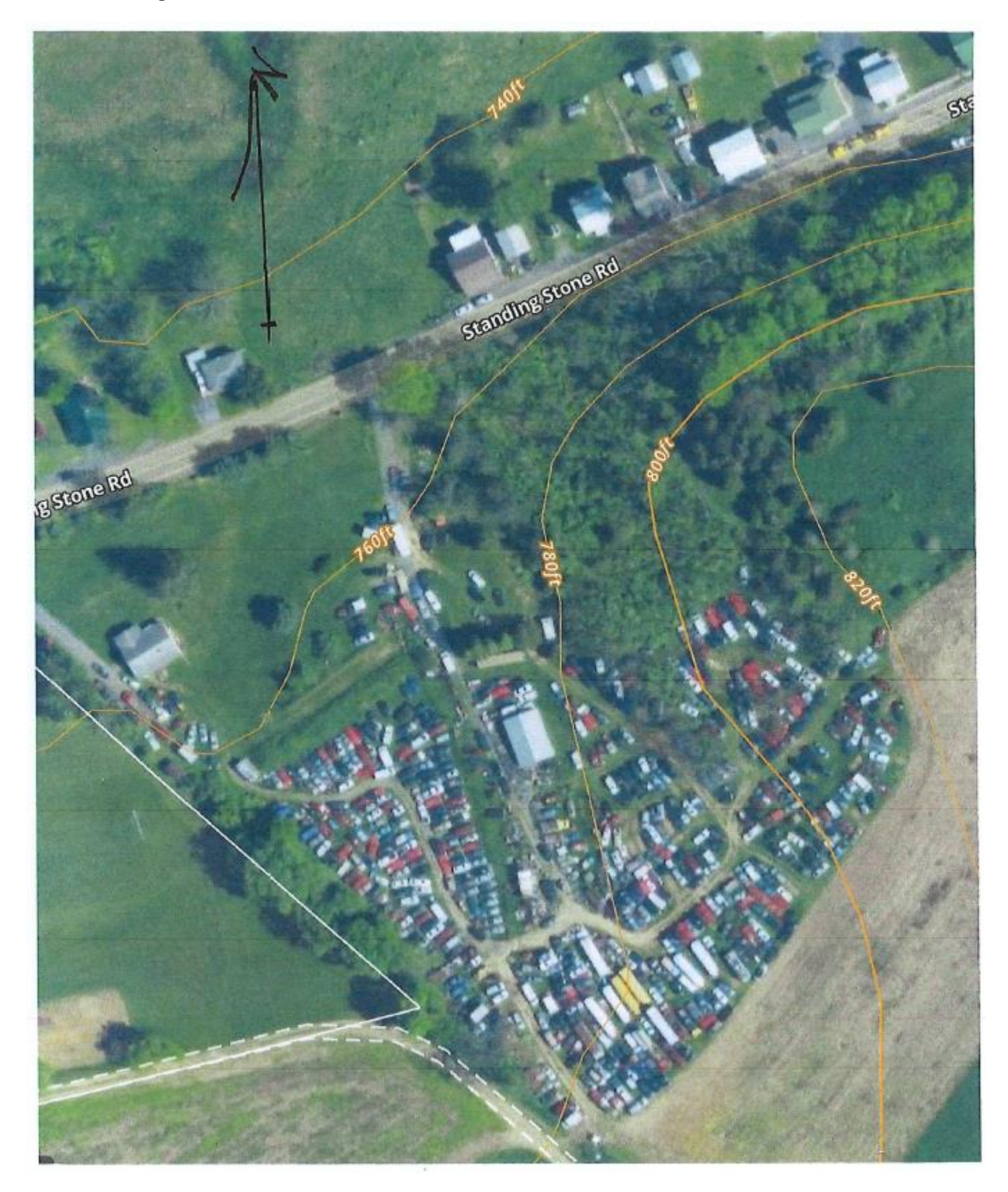
FIGURE 3. SITE AERIAL VIEW