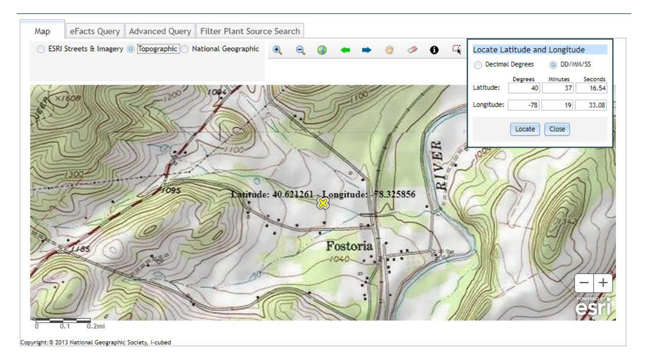
Figure 2: Aerial Photograph of the subject facility