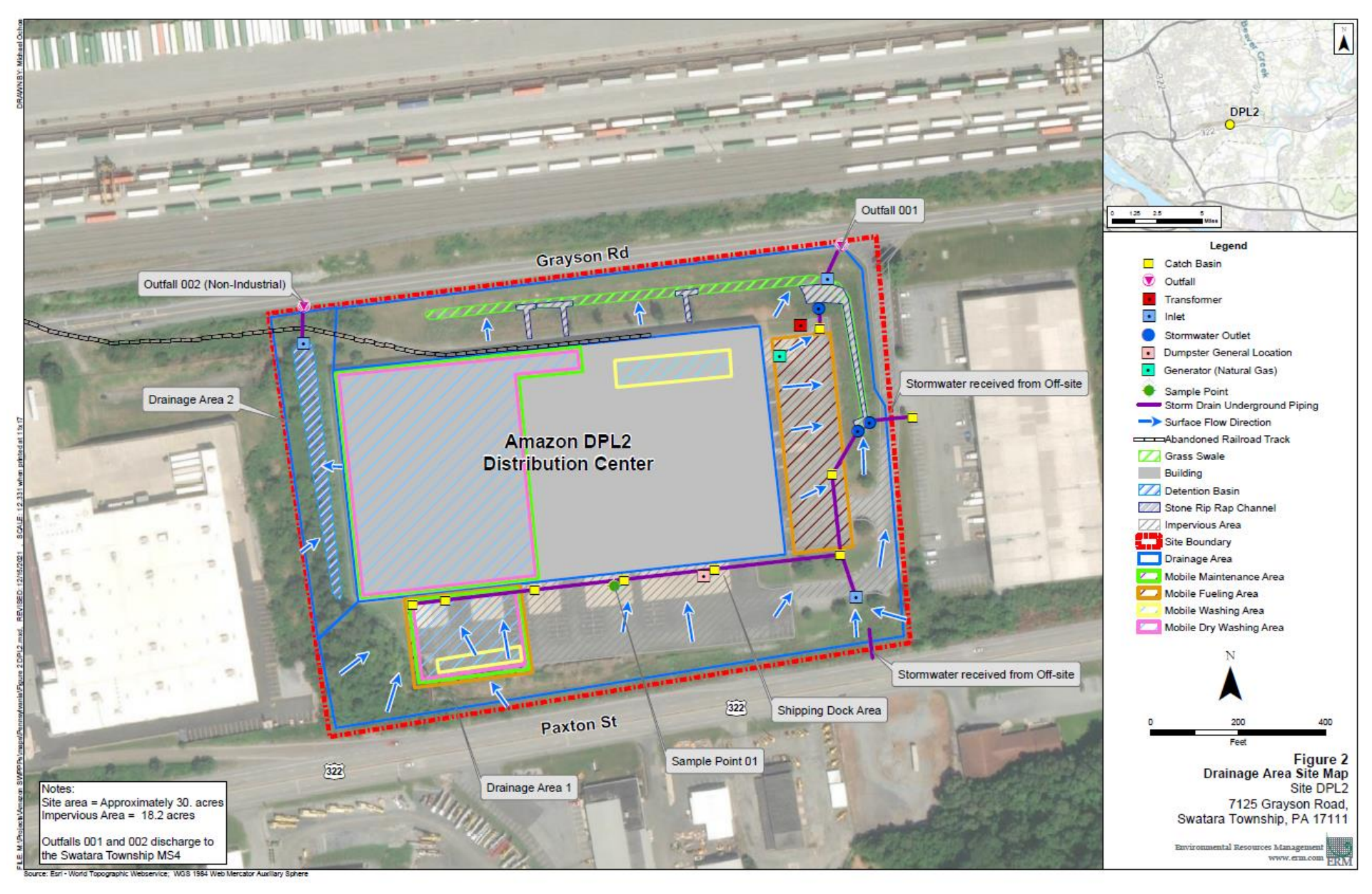
Figure 2. Site Map