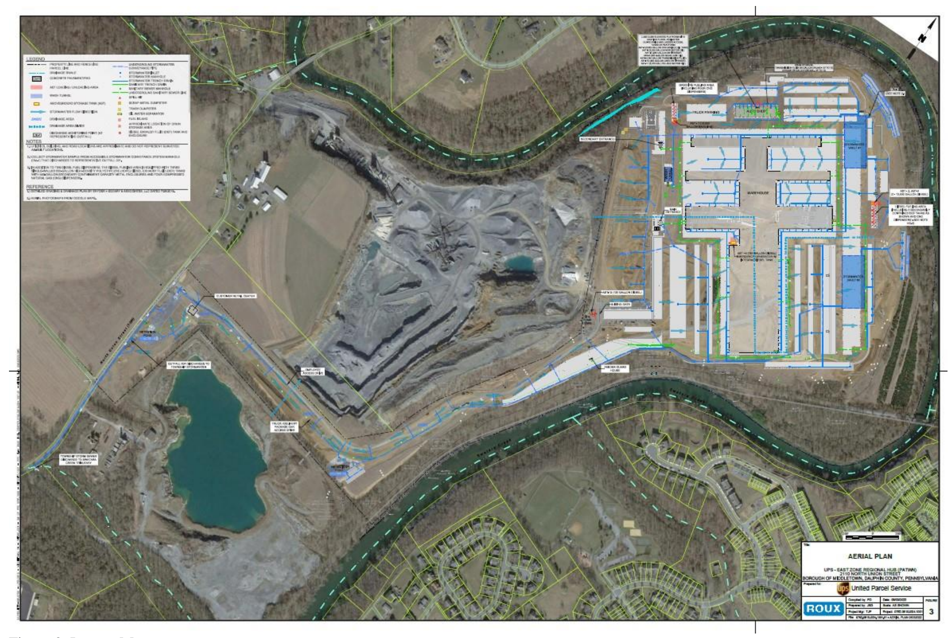
Figure 2. Layout Map