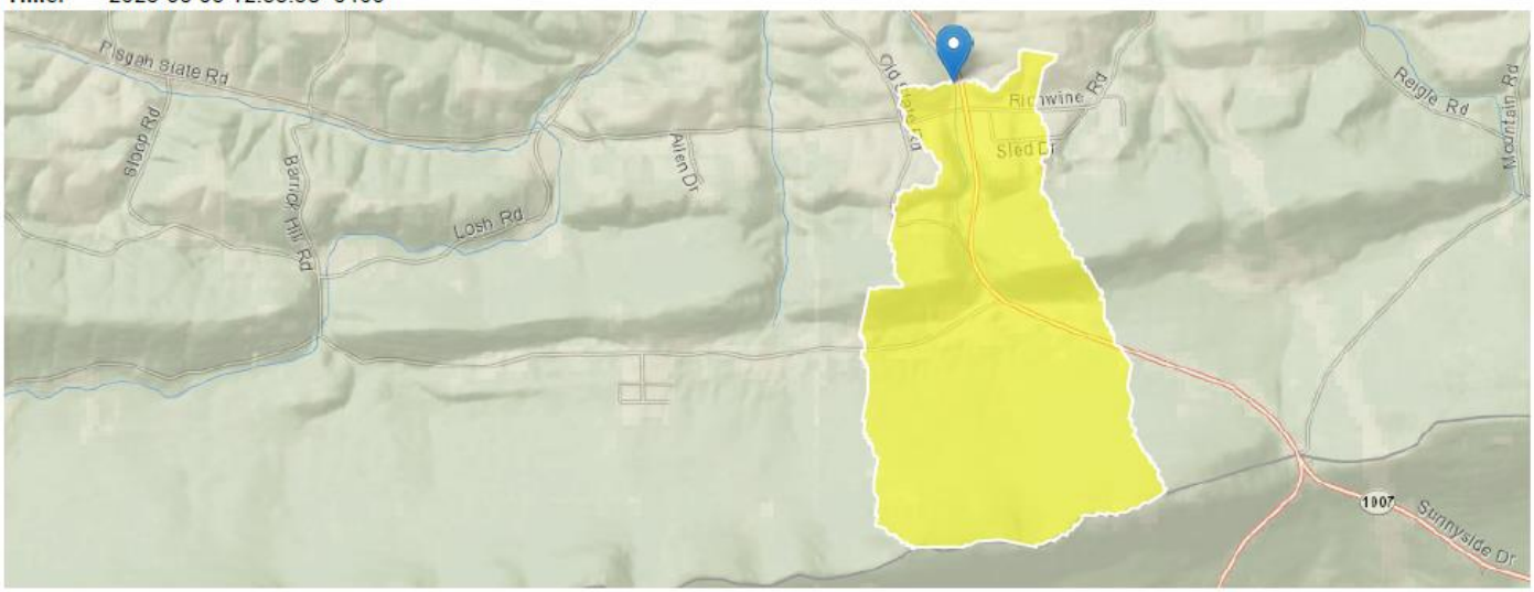
English Residence PA0294063 Modeling Point #1 May 2023