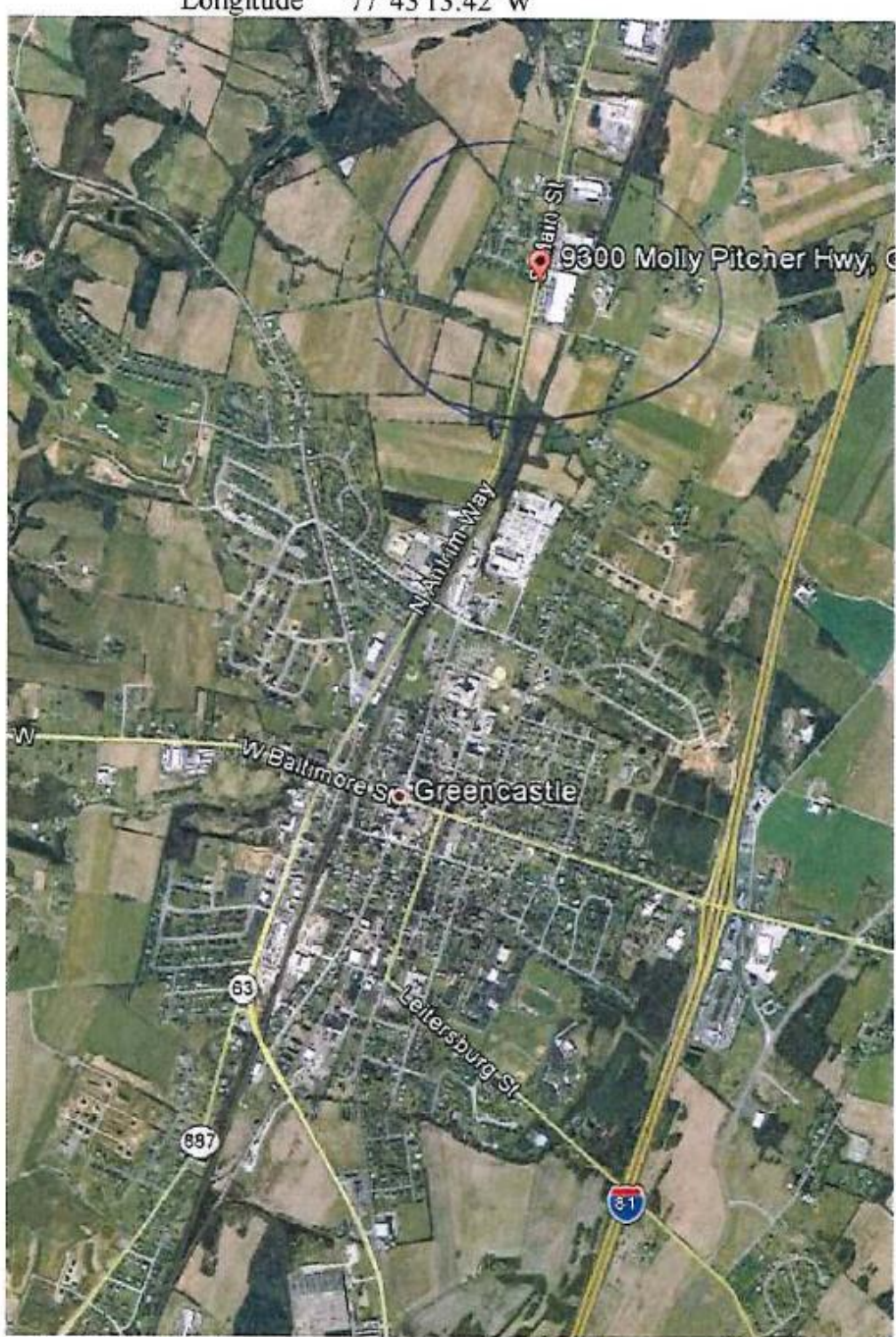
Figure 2. Site Location Map

Latitude 39°48'28.42"N Longitude 77°43'13.42"W