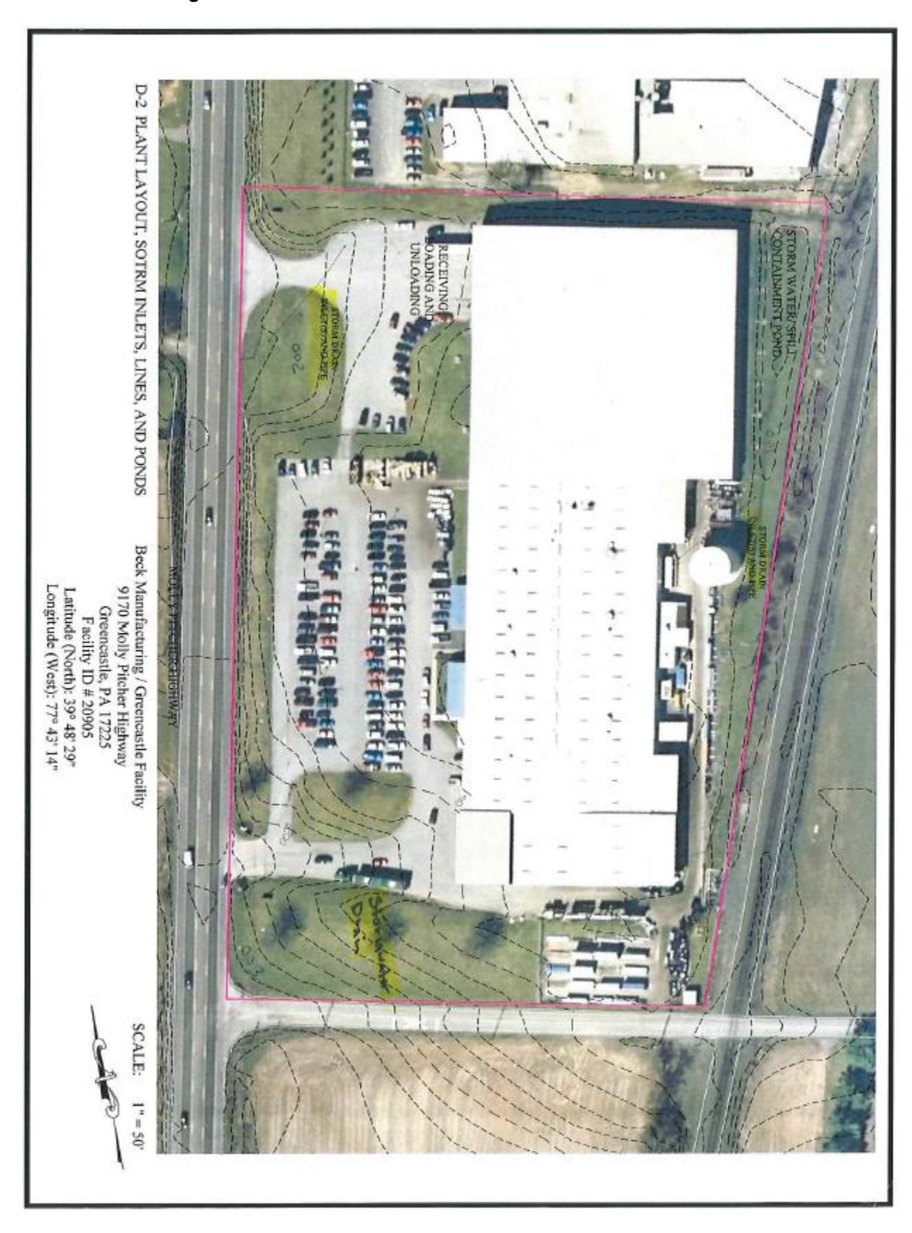
Figure 3. Site Layout