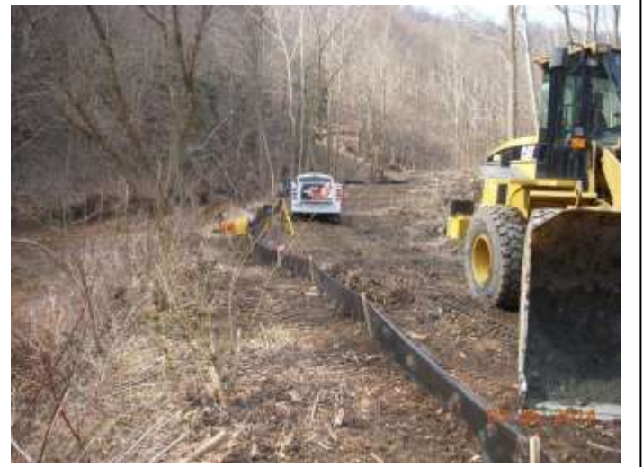
Contractor placing entrance road to job site under PA Turnpike bridge.