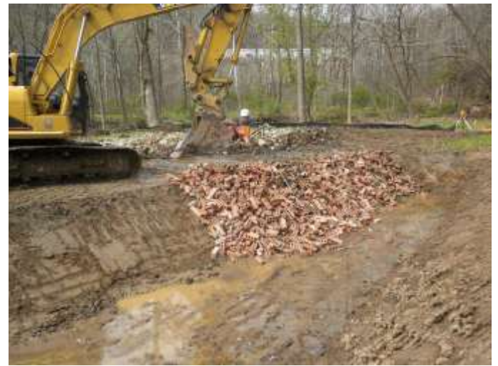
Contractor placing E&S around excavated ponds.