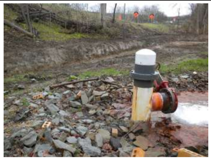
Contractor excavating for well head pads.