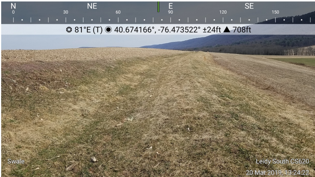
ID: Photo 8 Date: 3/20/2019 Comments: This photo shows a view of a grass lined swale within the investigation area.