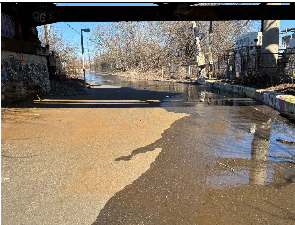
Looking north along Bartram's Garden trail from south side of railroad bridge.