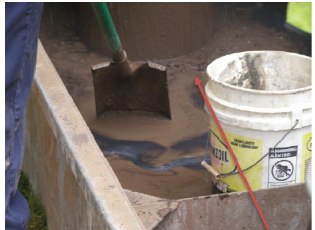
The first appearance of the presence of coal silt 9-10-25