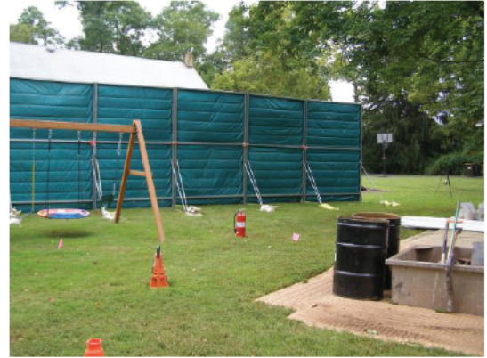
Sound barriers set up at [REDACTED]