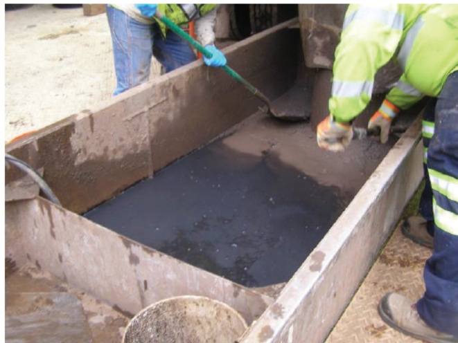
Coal shale (dark liquid) floating on water from MW-11D 9-10-25