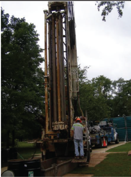
Drill rig set up at [REDACTED] 9-10-25