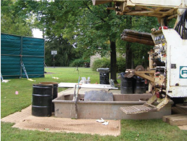
Sound barriers set up at [REDACTED] 9-10-25