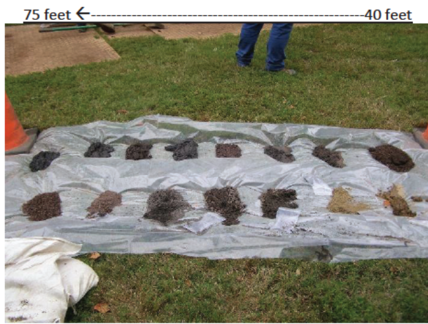
Soil samples from every 5 feet while installing MW-11S 9-10-25