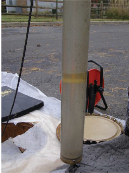
Skimmer removed from recovery well RW-3 on Glenwood Drive 10-20-25 @ 10:02