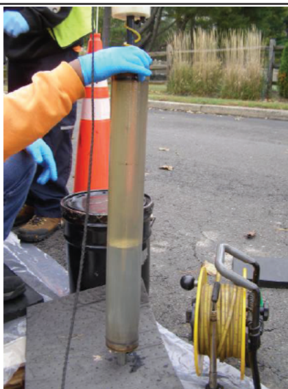
Skimmer removed from recovery well RW-2 on Glenwood Drive 10-20-25 @ 9:52