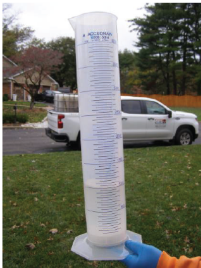
Bailed water from former potable well on [REDACTED] 10-20-25 @ 9:13