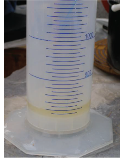
Amount of LNAPL recovered from RW-3 (100 mL) 10-20-25 @ 10:06