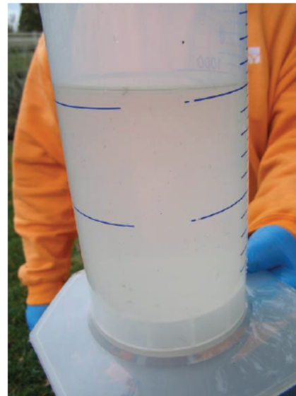
Minimal LNAPL from former potable well at [REDACTED] 10-20-25 @ 9:14