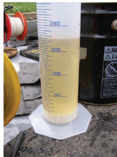
Amount of LNAPL recovered from RW-2 (1,750 mL) 10-20-25 @ 9:55