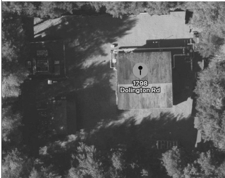
Map location of Energy Transfer's emergency response trailer (Photo 1)