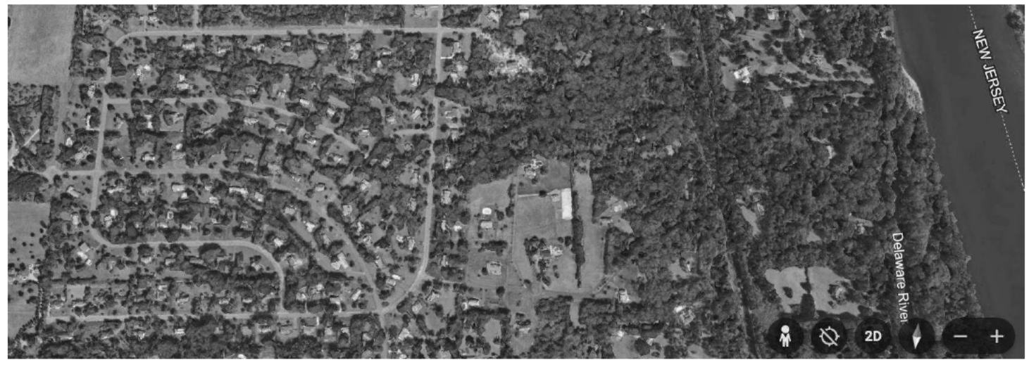
Neighborhood impacted by the pipeline release. (Photo 2)