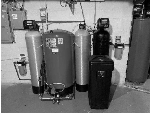
Privately installed POET system installed at [REDACTED]