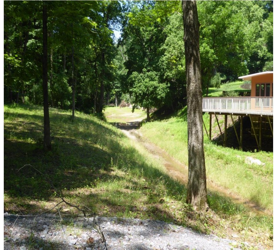
West towards Solebury School.