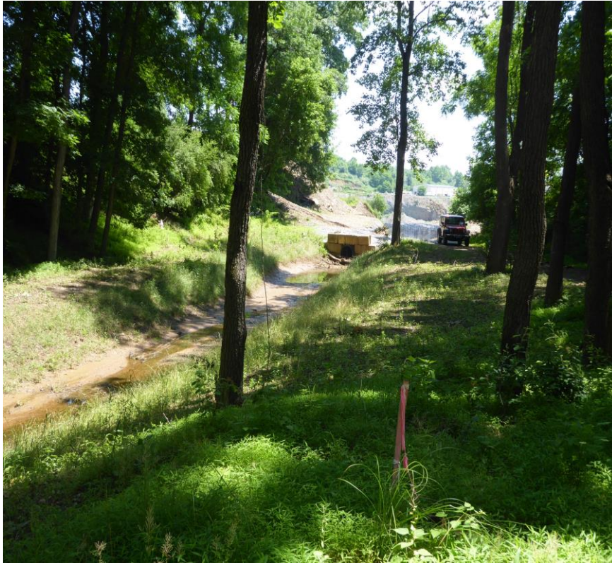
Looking east towards quarry.