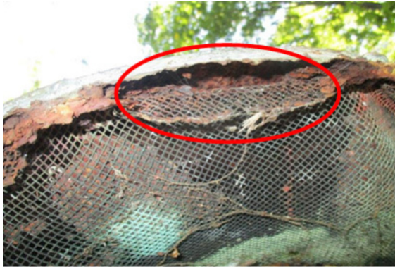
Figure 2: A storage tank overflow with a compromised screen

Giardia . It is important for public health protection to keep these disease-carrying insects out of finished water storage tanks. No-see-ums can be as small as 1 mm (0.039 inch). A 24-mesh screen with 0.0277-inch openings will prevent even these tiny insects from entering a ground level tank.