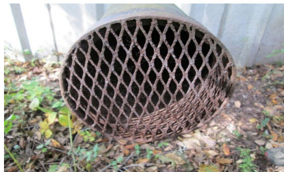
Figure 1: A storage tank overflow grate with large openings

According to the standards, an overflow or vent for a ground-level storage tank must be protected with a 24-mesh noncorrodible screen. This means that the screen material must have 24 openings per linear inch. The size of each opening is dependent on the diameter of the wire that makes up the screen. For example, a 24-mesh screen made of wire with 0.014-inch diameter produces openings of only 0.0277 inches.