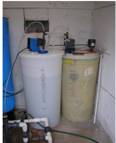
Day Tanks and Feed Pumps

Trained responders drained the day tank and ventilated the chlorine gas, resolving the immediate hazards. The maintenance employee recovered with no long-term issues and there were no other reported injuries. The certified operator had to drain and flush the treatment facilities, replace some of the chemical feed equipment, purge the distribution system and demonstrate that the water system was delivering water of acceptable quality before the water system could return to service and students and staff were able to return to routine school life.