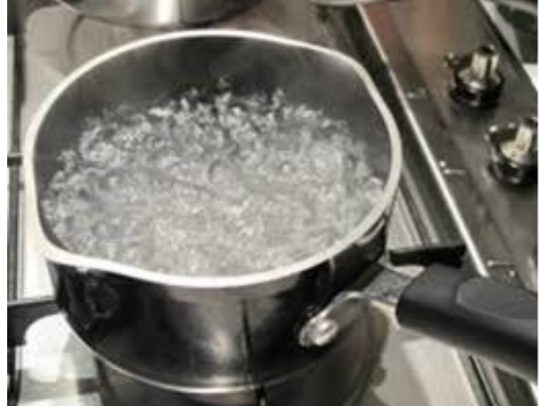
Pot of boiling water

Every public water supplier must face the possibility that someday they may need to issue a Boil Water Advisory (BWA) following an incident that confirms microbial contamination or creates an elevated risk of microbial contamination. Common incidents that require a BWA include: exceeding the Maximum Contaminant Level (MCL) for E. coli; water main breaks that result in both the loss of positive pressure and a definable risk of contamination; treatment technique violations; or failure of a key treatment process. Whatever the cause, lifting a BWA once it is in place is not as simple as just declaring the problem solved. It requires a multi-level response that is designed to ensure customers are receiving water that is free of contamination.