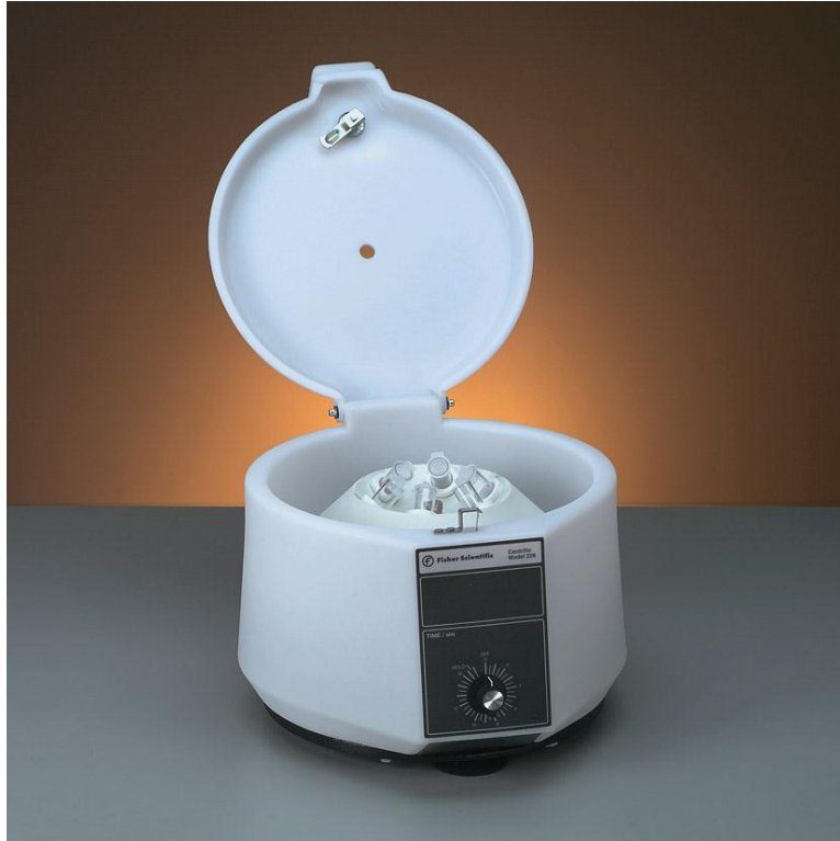
Figure 1.9 Centrifuge 9