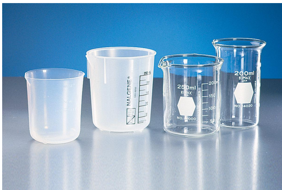
Figure 1.1 Beakers 1