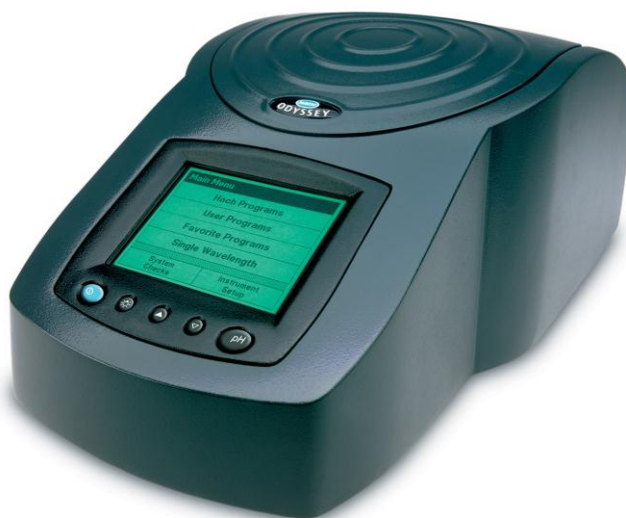
Figure 1.7 Spectrophotometer 7