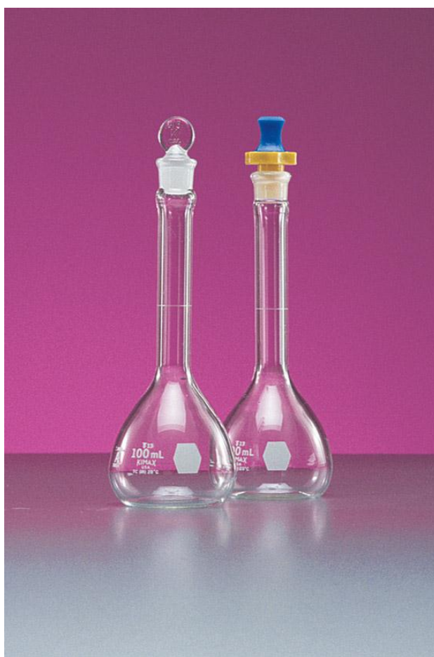
Figure 1.4 Volumetric Flasks 4