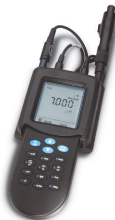
Figure 1.5 pH Meters 5