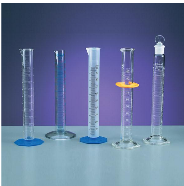
Figure 1.2 Graduated Cylinders 2