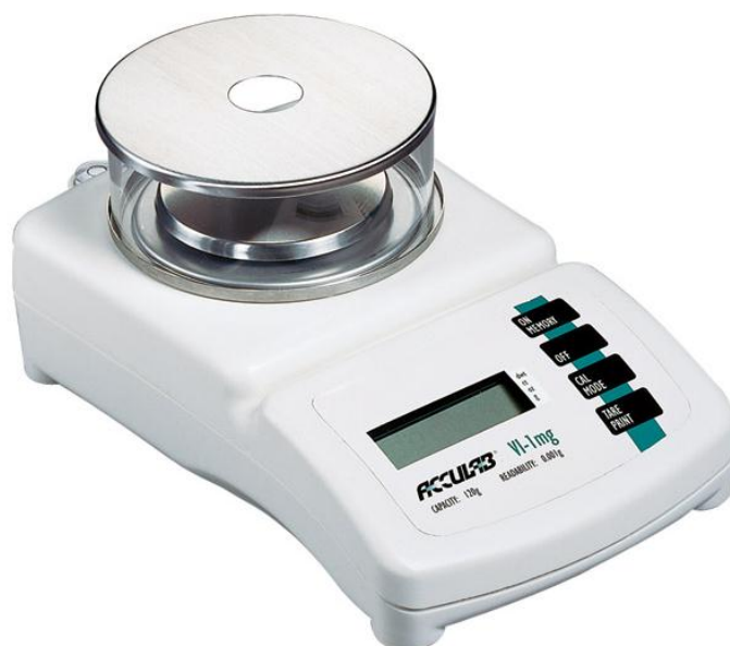
Figure 1.6 A Balance 6