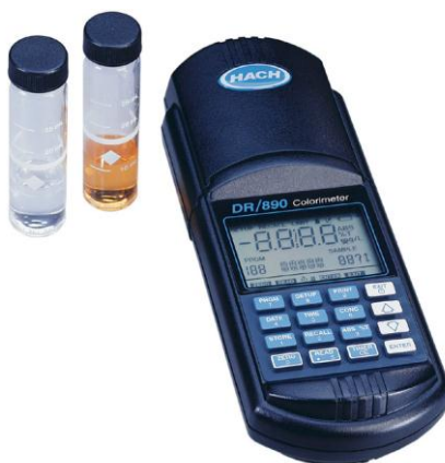
Figure 1.8 Colorimeter 8