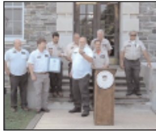
Pictured Lancaster's operators

Congratulations were extended to the City of Lancaster – Conestoga Water Treatment Plant on successfully receiving the “Five-Year Directors Award” of recognition as part of the Partnership for Safe Water program. This achievement is no small task. Everyone involved should be very proud of this accomplishment. The City of Lancaster – Conestoga Water Treatment Plant is a long-time member of the Partnership for Safe Water Program. Lancaster was the first to sign the Partnership for Safe Water Agreement for participation in 1995. In 1998, it was the first to complete the Self-Assessment Phase III, and is one of only two plants to receive the “Five Year Directors Award” 2004 in Pennsylvania. Lancaster Bureau of Water serves a population of 110,000, processing 12 million gallons of water from the Conestoga River.