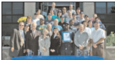
Pictured top to bottom: Queens Lane WTP Operators, Belmont WTP Operators, Baxter WTP Operators