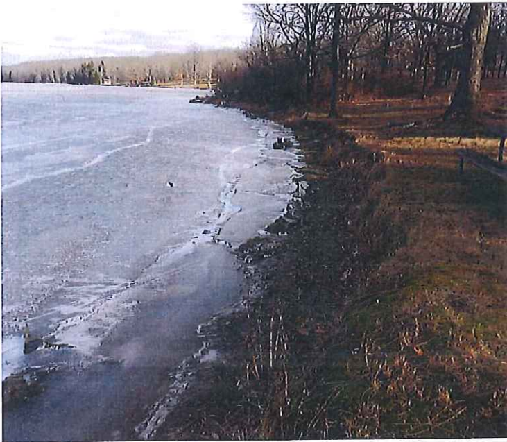
Pre - Construction

Project Results: A total of 102 structures were installed which included: Stone Framed Rock Deflectors, Sawtooth Deflectors, Rock Rubble Piles, Felled Shoreline Trees, and Rootwad deflectors. These structures have stabilized the Muskrat Beach Shoreline in return reducing sediment loading into the lake while also providing fish and aquatic habitat.