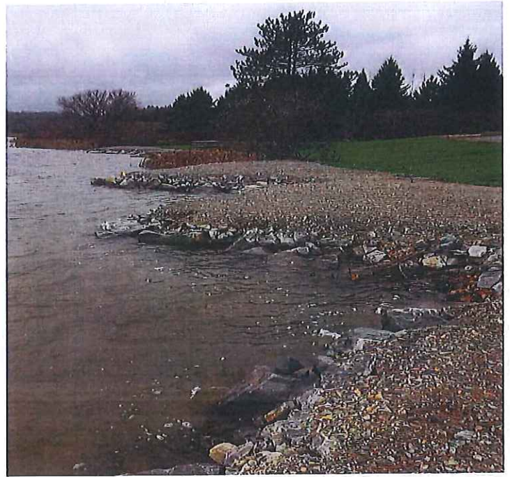
Post - Construction

Project Grants/Contributions: See Project Summary for Killbuck Cove – Site #2