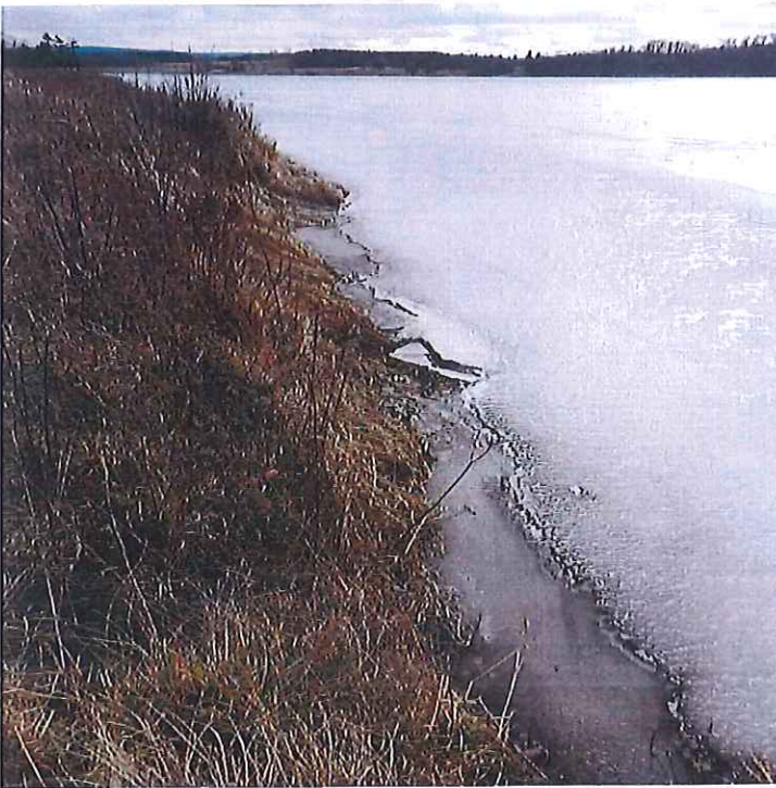
Pre - Construction

Project Results: A total of 244 structures were installed which included: Stone Framed Rock Deflectors, Rock Rubble Piles, Felled Shoreline Trees, and Rootwad deflectors. These structures have stabilized the Killbuck Cove Site #2 Shoreline in return reducing sediment loading into the lake while also providing fish and aquatic habitat.