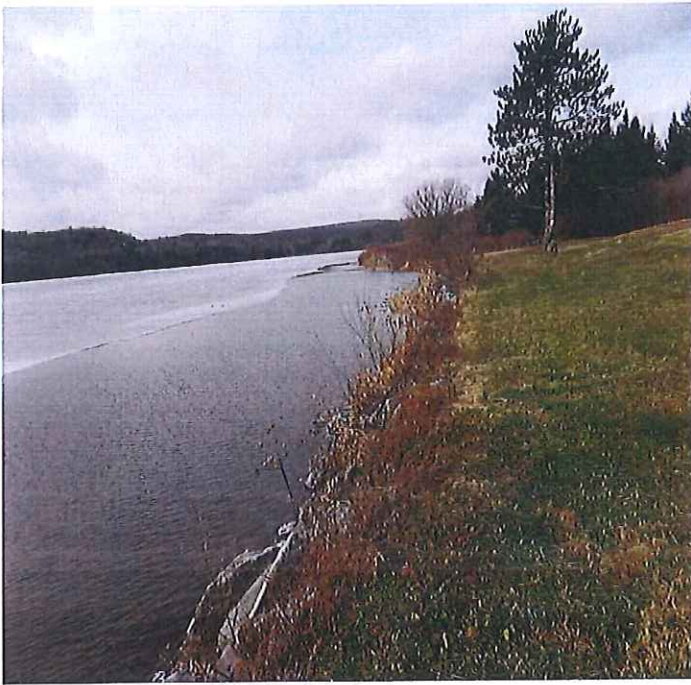
Pre - Construction

Project Results: A total of 67 structures were installed which included: Stone Framed Rock Deflectors, Rock Rubble Piles, and Felled Shoreline Trees. These structures have stabilized the Killbuck Cove Site #1 Shoreline in return reducing sediment loading into the lake while also providing fish and aquatic habitat.