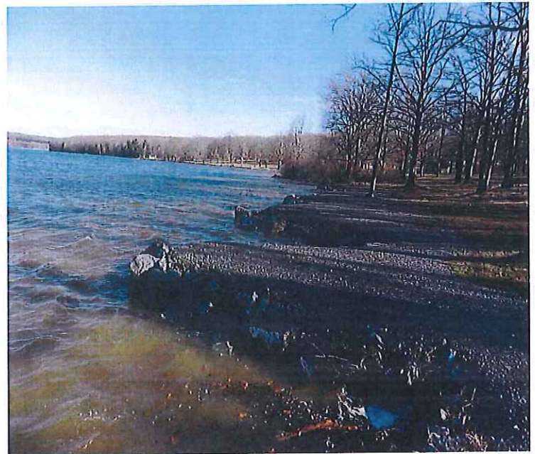
Post - Construction

Project Grants/Contributions: Muskrat Beach - Growing Greener Grant: $55,501.19 PA DCNR -State Parks $980.00 Total Costs: $56,481.19