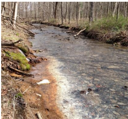
Stream prior to improvements

The project was executed successfully. The original design plan was revised to reflect more recent increased rainfall and streamflow data by increasing the size of and relocating the treatment system to a larger and more accommodating site. The system was constructed in 2022 and is now operational.