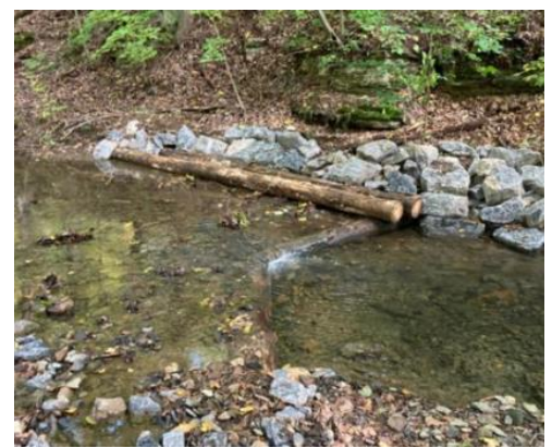
Stream after improvements

Design consultant hire, base mapping, wetland delineation, design, engineering, permitting, competitive bid, construction, construction observation, O&M plan and reports.