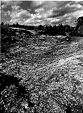
Pond during construction