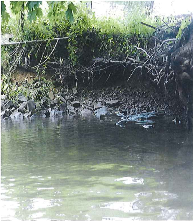
Pre - Construction