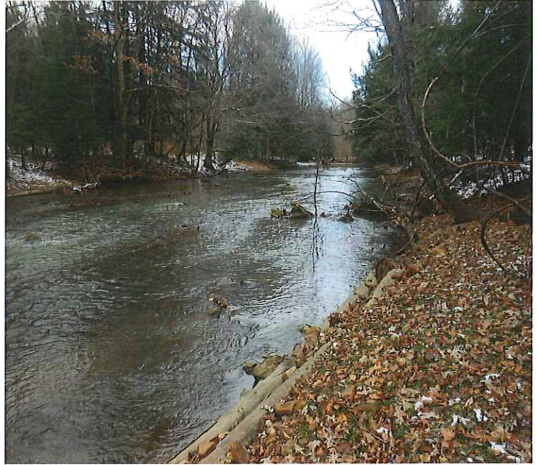
Post - Construction