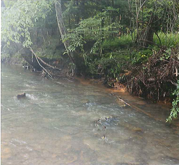
Pre - Construction

Project Results: The streambanks were sloped and stabilized with 7 fish habitat structures which stabilized eroding streambanks and reduced sediment loading into the stream.