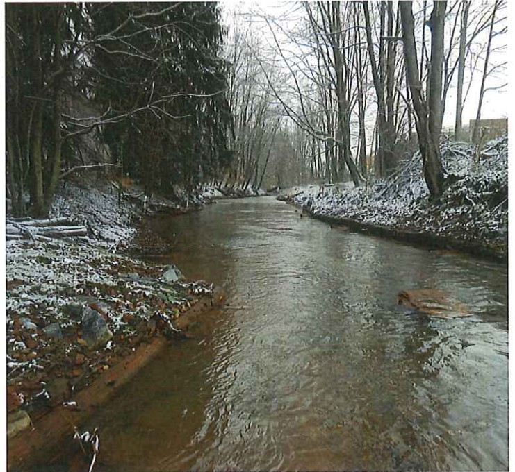
Post - Construction