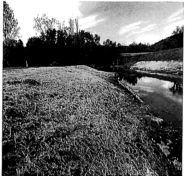
Post - Construction

Project Grants/Contributions: Growing Greener Grant: $21,260.00 PA Fish & Boat Commission: $451.16