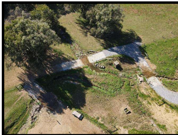
Three Crossings and Fencing