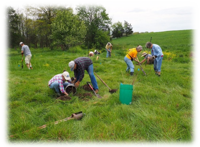
Local volunteers planting riparian buffers.