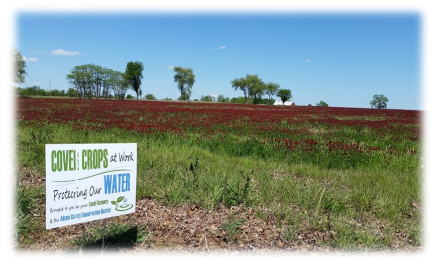
Cover crops are essential to Adams County soil and water quality and are strongly supported by the ag community in Adams County. Pictured above are educational signs placed on local farms that cover cropped.

First, programmatic changes are a priority that recommend statewide activities that are needed to facilitate the implementation of this plan's recommendations. Reporting and tracking are essential to understanding what is already on the ground (establishing an accurate baseline) and tracking Best Management Practices (BMPs) implementation and water quality conditions