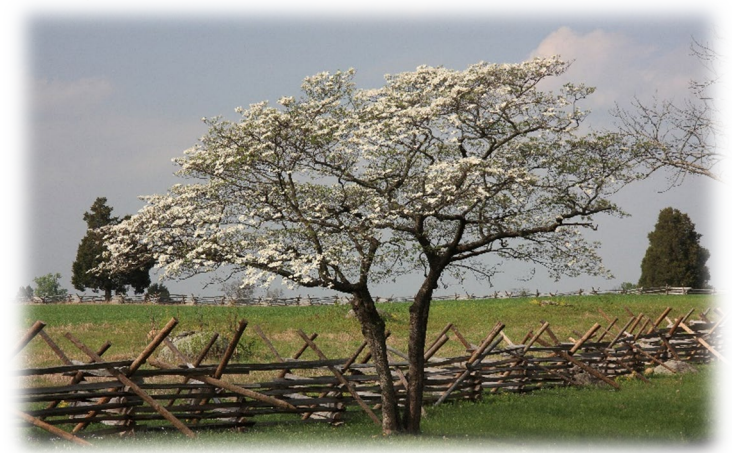
Adams County is home to the Historic South Mountain Fruit Belt produces more apples than any county in the Commonwealth.

is associated with several recommended actions, listed below.