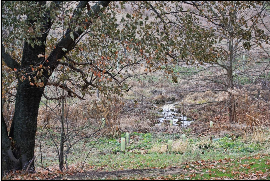
Image 2. Tree/shrub protective tubes along spring-fed stream.

Despite these challenges, local stakeholders are motivated to make real progress, and have suggested many creative ideas for overcoming obstacles. The Centre County CAP makes real progress possible.