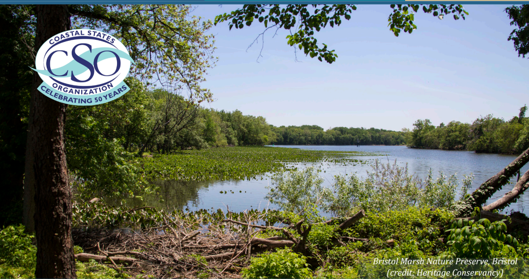
Bristol Marsh Nature Preserve, Bristol