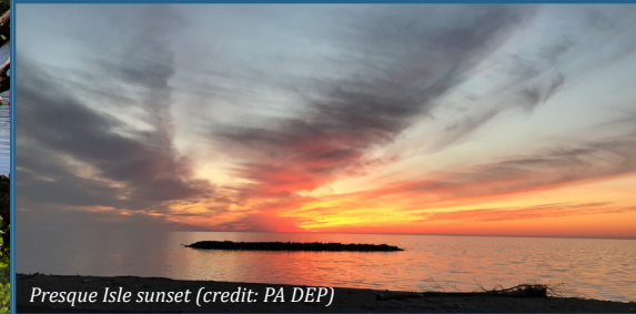
Presque Isle sunset