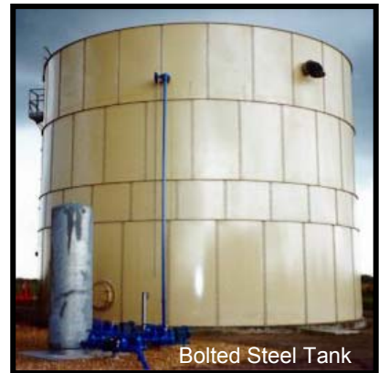
Bolted Steel Tank