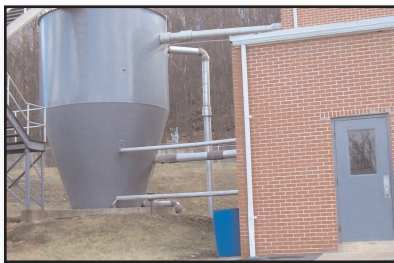
Spring Township Municipal Authority's upflow clarifier (left) and the chemical feed building (right).