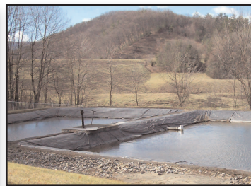
The water treatment plant's sludge beds are shown with Kern Run Dam in the background.