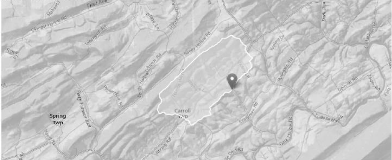
Carroll Elementary School PA0084034 Modeling Point #2 May 2023

Region ID: PA Workspace ID: PA20230515172038460000 Clicked Point (Latitude, Longitude): 40.37143, -77.15112 Time: 2023-05-15 13:20:59 -0400