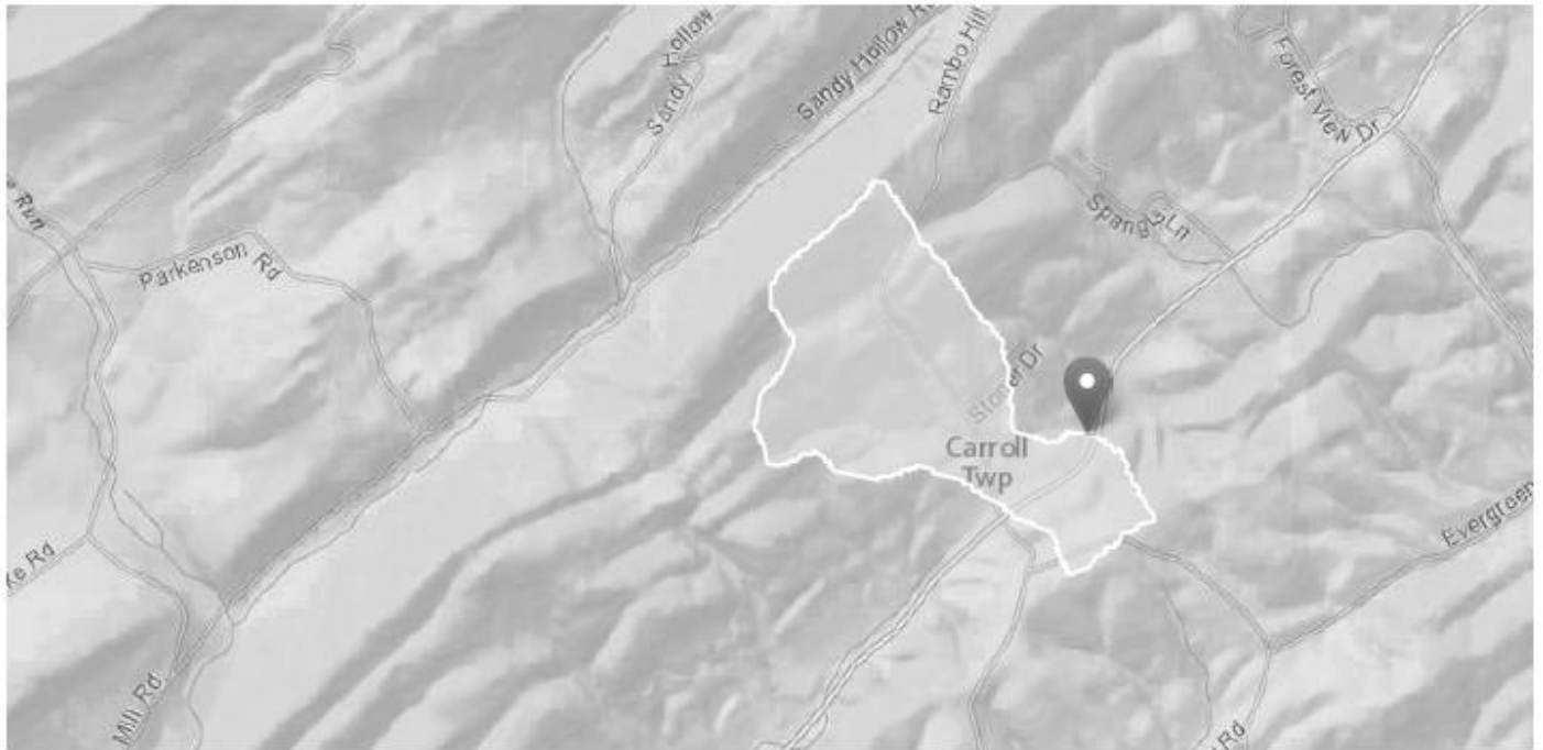
Carroll Elementary School PA0084034 Modeling Point #1 May 2023

Region ID: PA Workspace ID: PA20230515171727149000 Clicked Point (Latitude, Longitude): 40.36461, -77.16788 Time: 2023-05-15 13:17:48 -0400