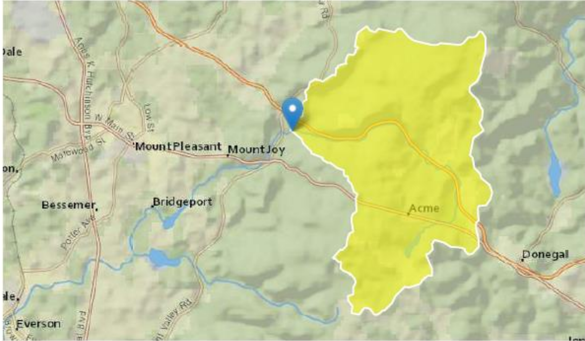
Laurelville Mennonite Church STP

Region ID: PA Workspace ID: PA20210909104659953000 Clicked Point (Latitude, Longitude): 40.15244, -79.47617 Time: 2021-09-09 06:47:19 -0400