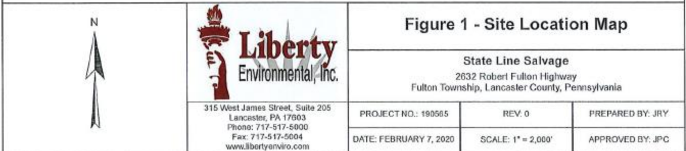
FIGURE 1. SITE LOCATION MAP