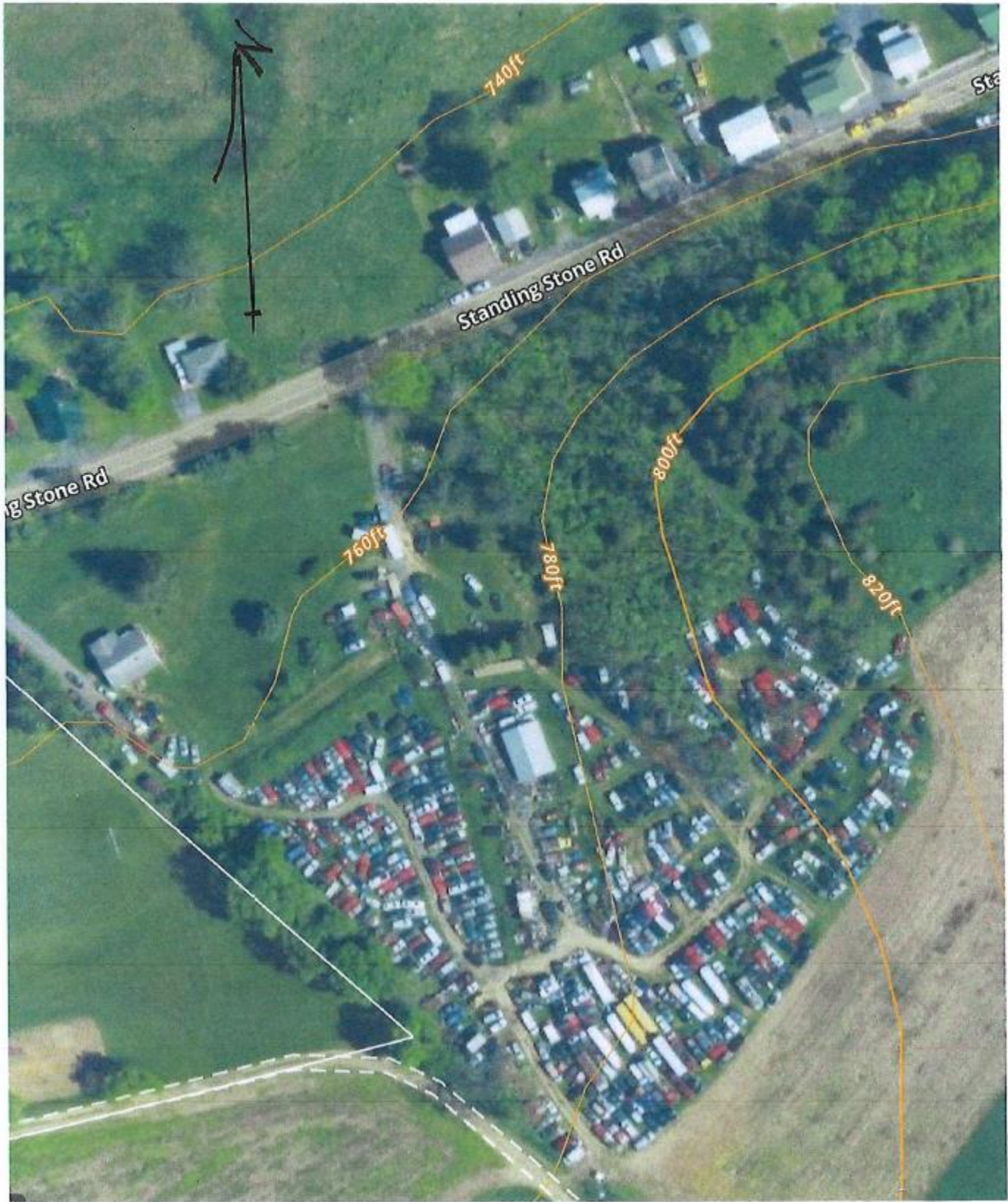
FIGURE 3. SITE AERIAL VIEW