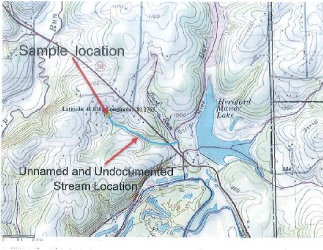
Figure 1. Approximate location of sampling point and the Unnamed and Undocumented Tributary to Doe Run (blue line).